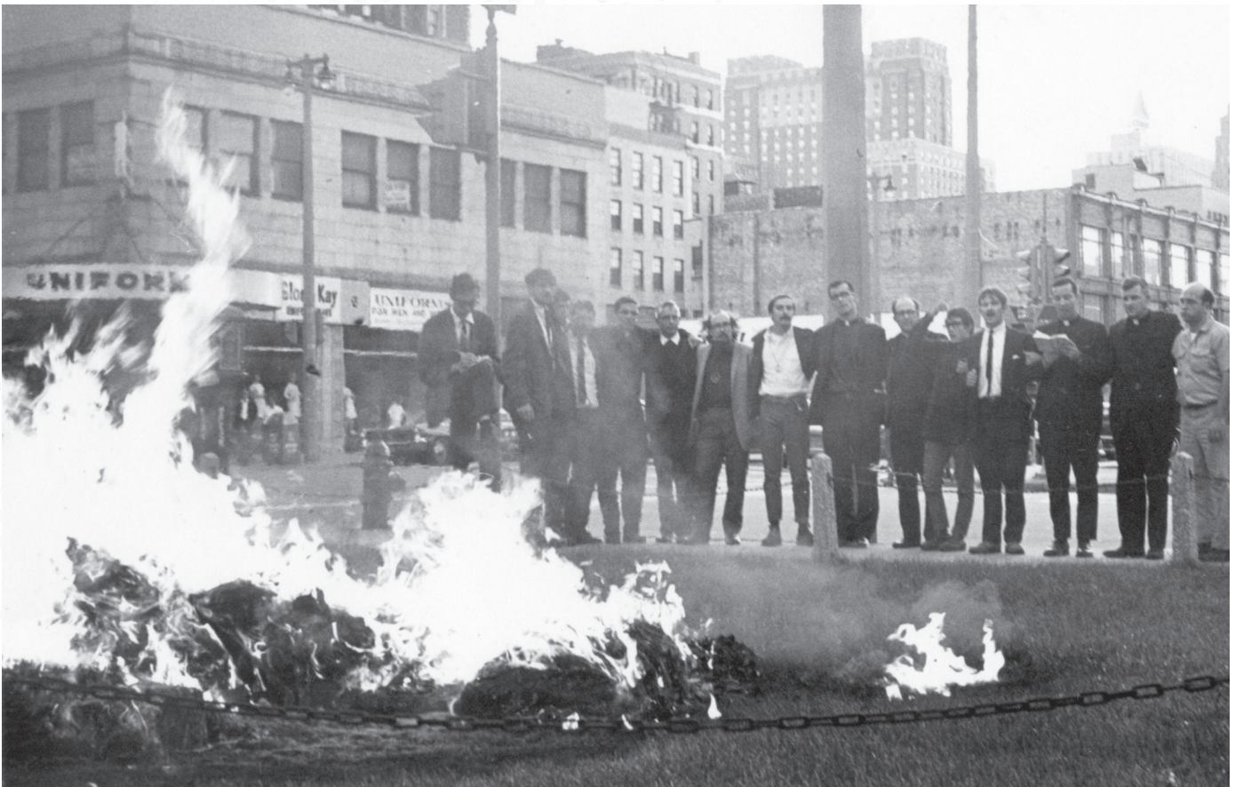
The Milwaukee Fourteen burning draft records.

“It seemed to me one of the tragedies of history that Christians, since the age of Constantine, had rarely put their obedience to Christ ahead of their obedience to the state.”