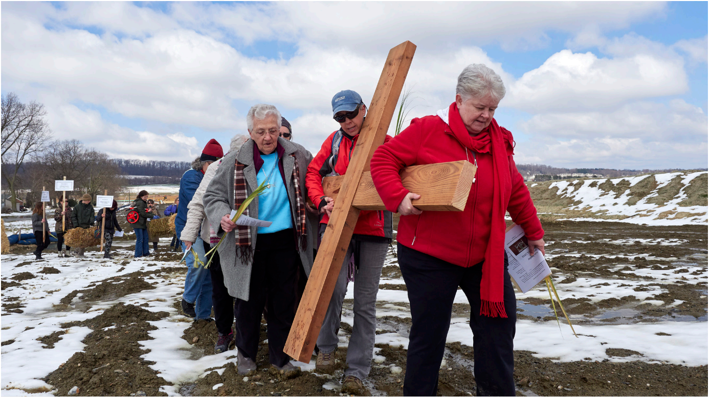
Members of the Adorers of the Blood of Christ and their supporters.

“As religious women of the Catholic Church, our faith impels us to stand up when the principles we hold sacred are compromised on the very land that is ours...This is not a political statement but a spiritual stand as people of faith.”