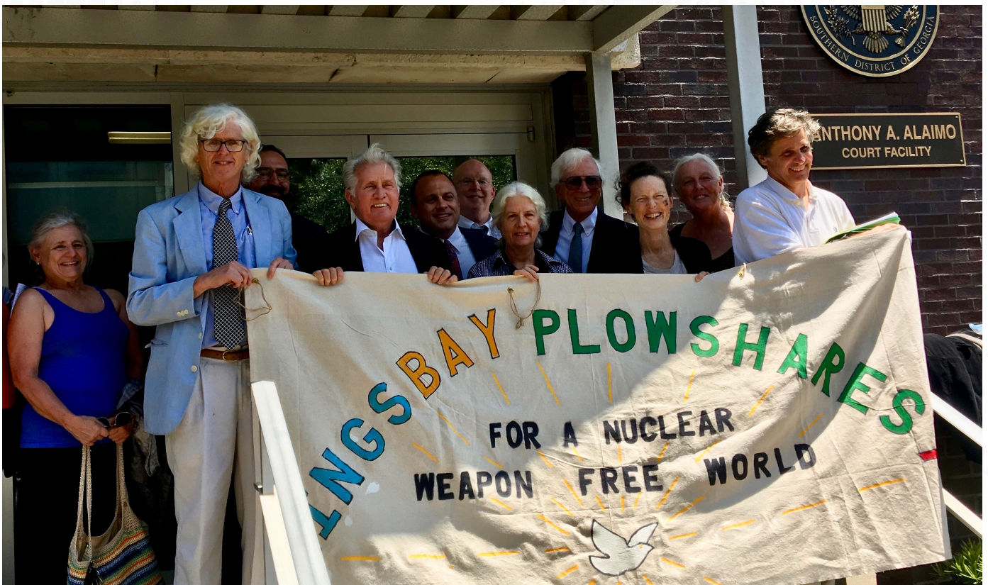
Members of the Kings Bay Plowshares and supporters outside a federal courthouse.

The “Kings Bay Plowshares Seven,” as they came to be known, were arrested and charged with conspiracy, trespass, destruction of property, and “depredation” of property. 221