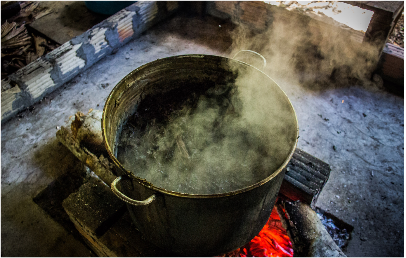
Hoasca brewing.

“The communion with Hoasca creates an enhanced state of consciousness, capable of amplifying one’s perception of his/her essentially spiritual nature, bringing about positive development in the moral and intellectual aspects of a human being.”