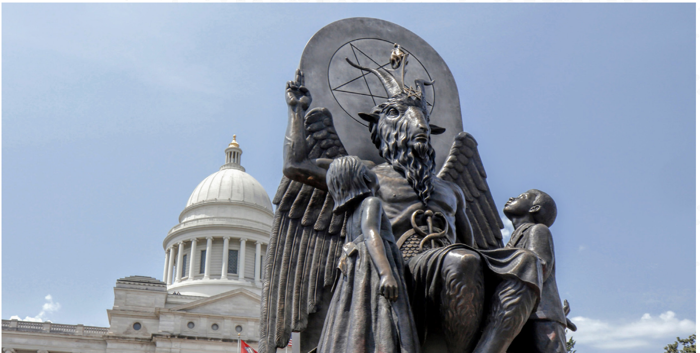
Statue of Baphomet in front of the Arkansas state capitol building for the Satanic Temple’s Rally for the First Amendment in 2018.

In addition, atheists and others have brought claims arguing that government acts that embrace or promote religious precepts violate their religious beliefs (or lack thereof). In New Doe