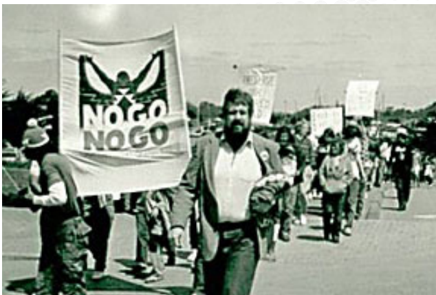
Protest of the proposed G-O road through the Six Rivers National Forest.

Despite the fact that Lyng and other pre-RFRA environmental Free Exercise claims were unsuccessful, Native American individuals and tribes and other religious practitioners have