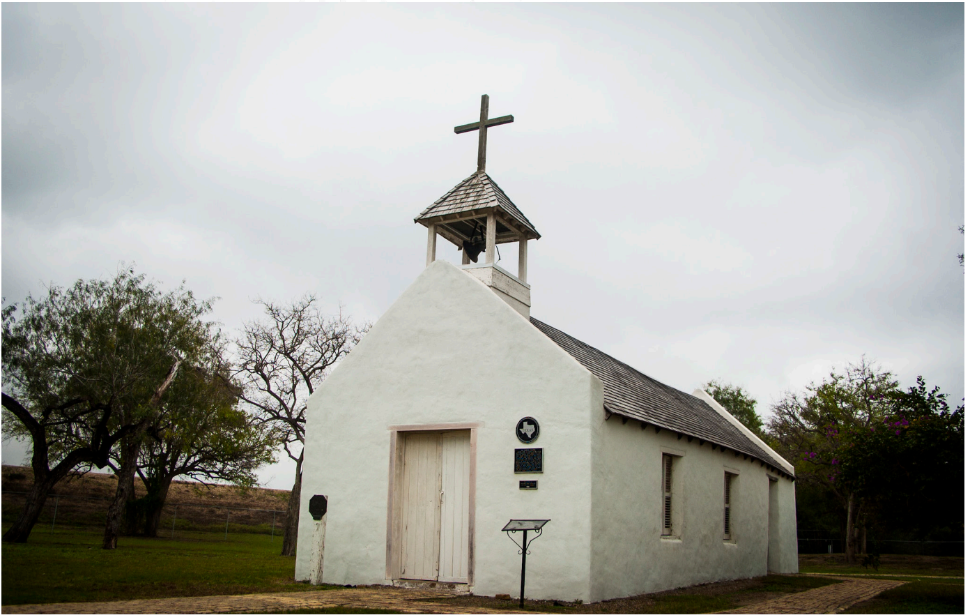
La Lomita Chapel in Mission, Texas.

“I consider a border wall likely to increase human suffering in the local community and in the world, in contravention of Catholic moral principles. The foundation of Catholic social teaching is that all human life is sacred.”